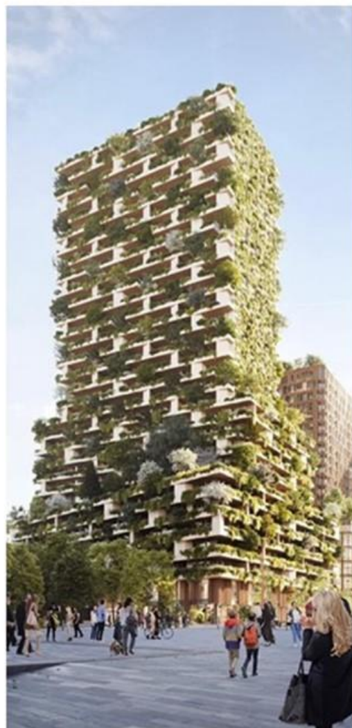
Pictured: The Wonderwoods Vertical Forest

Would you like to see more buildings like this one? Would you like to design a building? What would it look like?