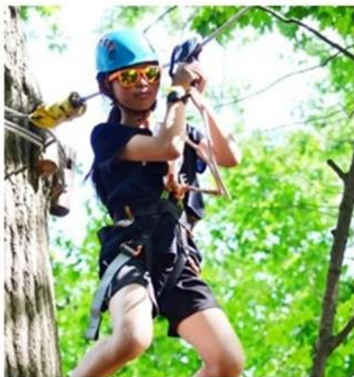
Pictured: A person on a zip wire.

It has recently been reported that plans to build a 650m zip wire in Scarborough, North Yorkshire have been submitted. Big Bang Promotions, an adventure tourism and activity provider, has said it would like to build four zip lines, each 650m in length in the seaside town! The company says the experience would start in front of the town's Open Air Theatre in North Bay and head towards the Scalby Mills miniature railway station, offering 'panoramic views out over the North Bay' along the way. The clifftop zip line adventure experience would launch from a temporary, steel-framed, 33m-tall tower, which can be put