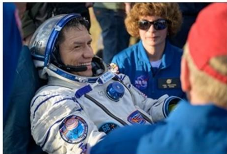
Pictured: NASA astronaut Frank Rubio in Kazakhstan as he landed back on Earth.

A NASA astronaut and two Russian cosmonauts have returned to Earth after an unplanned extended stay in space. The trio, who were stuck in space for just over a year, have safely landed in a remote area near Zhezkazgan, Kazakhstan. The original mission was scheduled to last 180 days. American astronaut, Frank Rubio, has set a record for the longest US spaceflight, after being away from home for 371 days. They couldn't come back to Earth from the International Space Station as planned because their original return capsule was hit and damaged by space junk. The Soyuz MS-23 capsule was then launched in February as a replacement to bring Frank