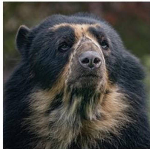
Pictured: Andean bear Oberon.