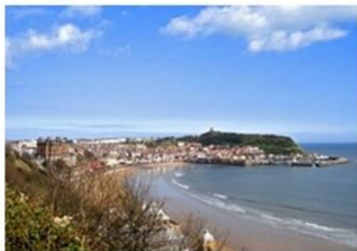
Pictured: A view of Scarborough.

It has recently been reported that plans to build a 650m zip wire in Scarborough, North Yorkshire have been submitted. Big Bang Promotions, an adventure tourism and activity provider, has said it would like to build four zip lines, each 650m in length in the seaside town! The company says the experience would start in front of the town's Open Air Theatre in North Bay and head towards the Scalby Mills miniature railway station, offering 'panoramic views out over the North Bay' along the way. The clifftop zip line adventure experience would launch from a temporary, steel-framed, 33m-tall tower, which can be put